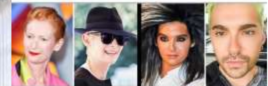
Тільда Суїнтон Фронтмен Tokio Hotel - Білл Каулітц